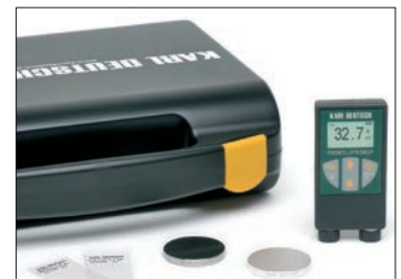
Pocket-LEPTOSKOP with accessories