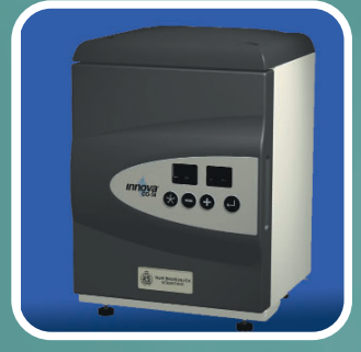
Innova Model CO-14 — At just 12.3" wide, this uniquely-sized miniature incubator lets you isolate sensitive samples for complete peace of mind.