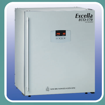
Excella ECO-170 provides reliable performance at an economical price.