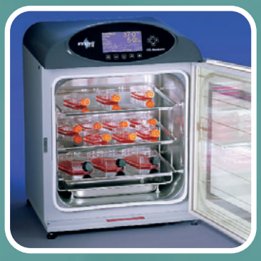
Personal-Sized Innova Model CO-48 yields a 1.7 cu. ft. chamber in an exceptionally small footprint.