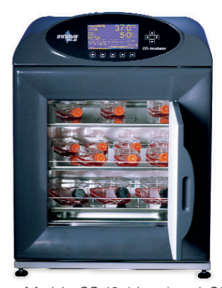
Innova Models CO-48 (above) and CO-170 (below) feature a cleverly-designed viewing window in the heated glass door, so you can check on cultures without altering chamber conditions. When chamber access is needed, a single door speeds entry.