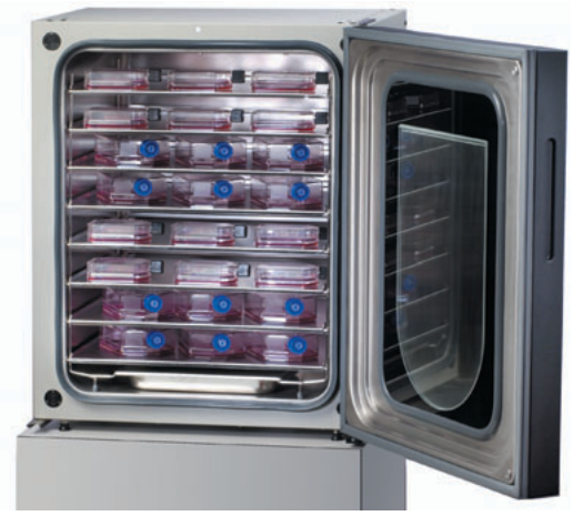
Uniquely flexible eight-position shelf is standard on Innova CO-170 and optional on Excella CO-170.