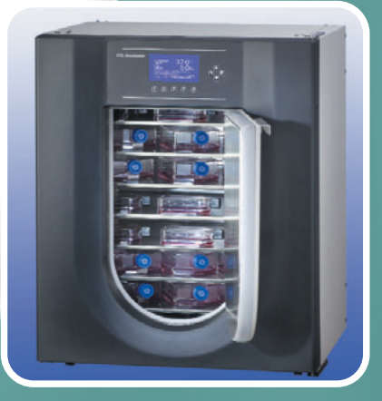
Innova CO<sub>2</sub> Incubators offer a wide range of advanced features including a built-in viewing window to avoid disturbing samples, tri-gas control option to optimize growth, and high-temperature decontamination option to protect your cultures. Innova CO-170 is shown.

Innova CO-14 — this miniature incubator allows you to easily isolate sensitive samples, avoiding cross-contamination issues. Designed for the rigorous requirements of in-vitro fertilization, it provides simple control with sophisticated design for a truly personalized culture environment.