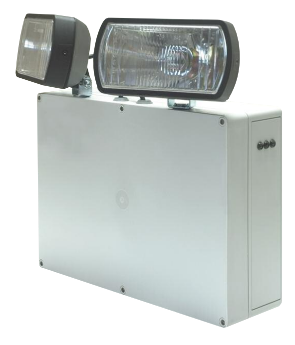
IP65 ♦ △ △ ▼ C€

AUTOTEST EMERGENCY VERSION - prefix catalogue number with 'TTS'. SCANLIGHT AT EMERGENCY VERSION - prefix catalogue number with 'DTS'.