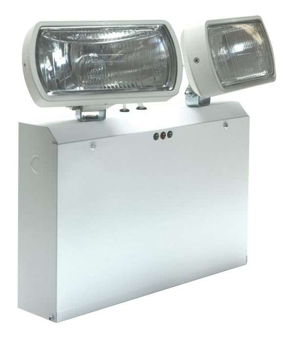
IP20 ▼ C€