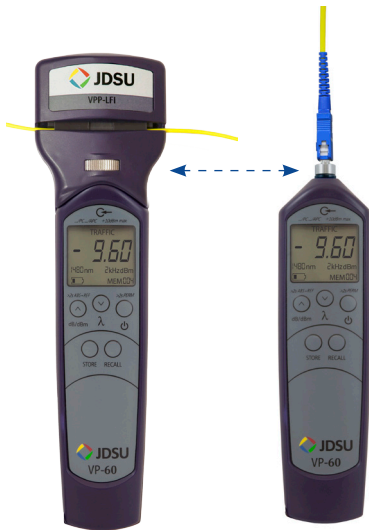
Live Fiber Identifier Optical Power Meter